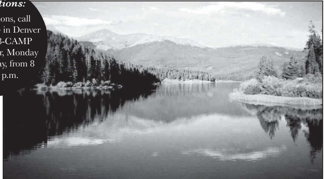
North Michigan Reservoir

For reservations, call (303) 470-1144 in Denver or 1-800-678-CAMP outside Denver, Monday through Friday, from 8 a.m. to 5 p.m.