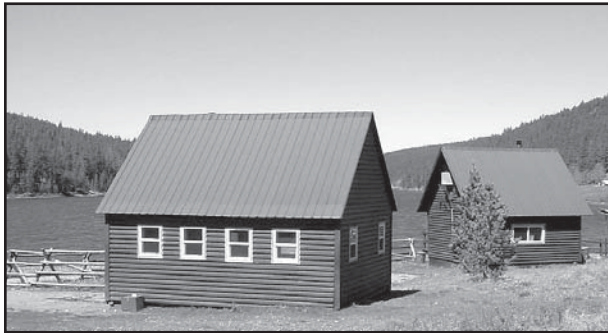
Cabins 4 & 5

The State Forest State Park is only two hours from Fort Collins, 75 miles west on Colorado Highway 14, past the famous Sleeping Elephant Mountain and over the beautiful Cameron Pass to the town of Gould.